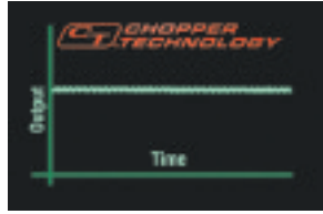
Chopper Technology® delivers extremely fast response for smoother output control.

Patented and award-winning Lincoln Chopper Technology® delivers superior DC arc welding performance for general purpose stick, Downhill Pipe, DC TIG, MIG, cored-wire and arc gouging.