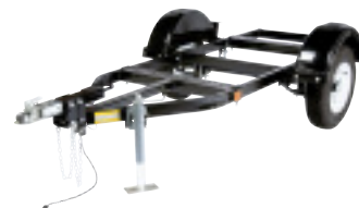
K2636-1 Medium Welder Trailer