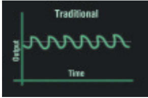
Traditional weld control is more variable around the desired output.