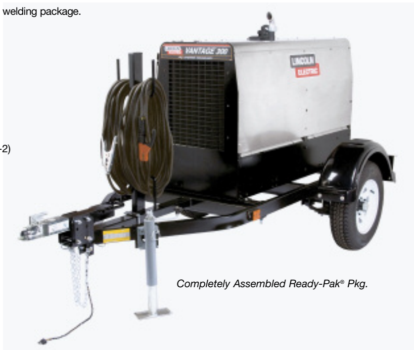
Completely Assembled Ready-Pak® Pkg.