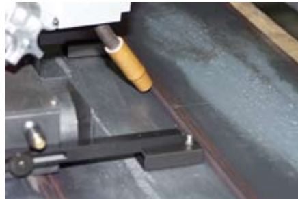
The BUG-GY can weld lap joints with a minimum height of 3/8" (9.53 mm).