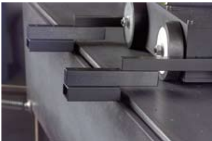
The BUG-GY can follow any outside edge.